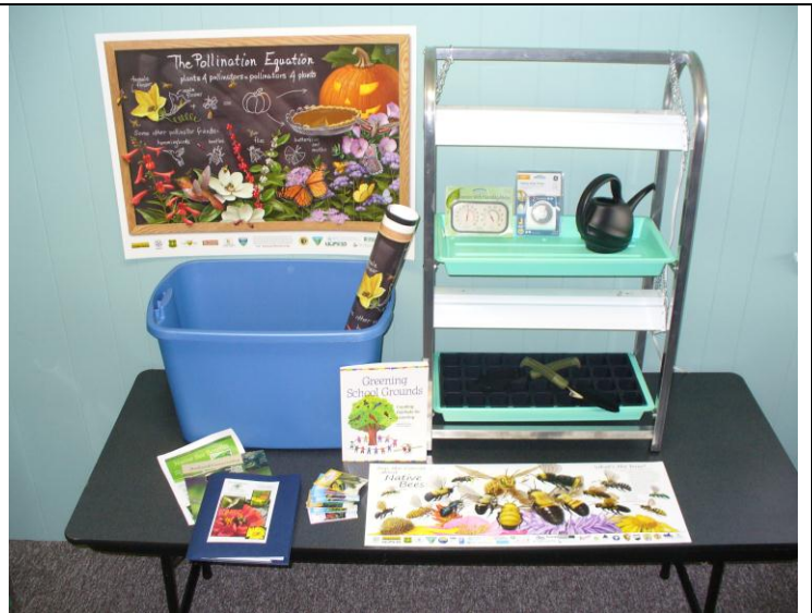
Photo Caption 2: Above: Participating classrooms receive a resource kit that includes a plant growing stand, grow lights, seeds, and numerous teaching materials.