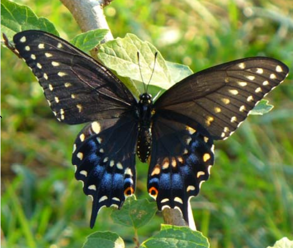
Black Swallowtail Butterfly

Where: Mercer County Soil Conservation District 508 Hughes Drive, Hamilton Square, NJ 08690