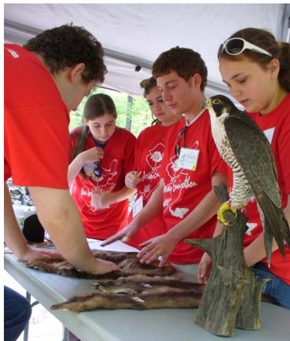
Above: Students compare mammal pelts during the hands-on section of the wildlife test at the 2011 NJ Envirothon.